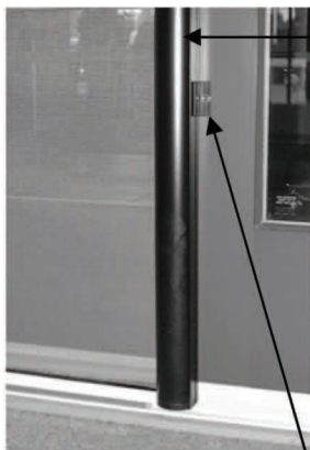
Surface Mount (Alternate Surface Mount Clips)

Sliding Patio Door Mounting Typically mount the housing so that the rear most side rests approximately 1-1/2” in on the stationary door panels center mullion